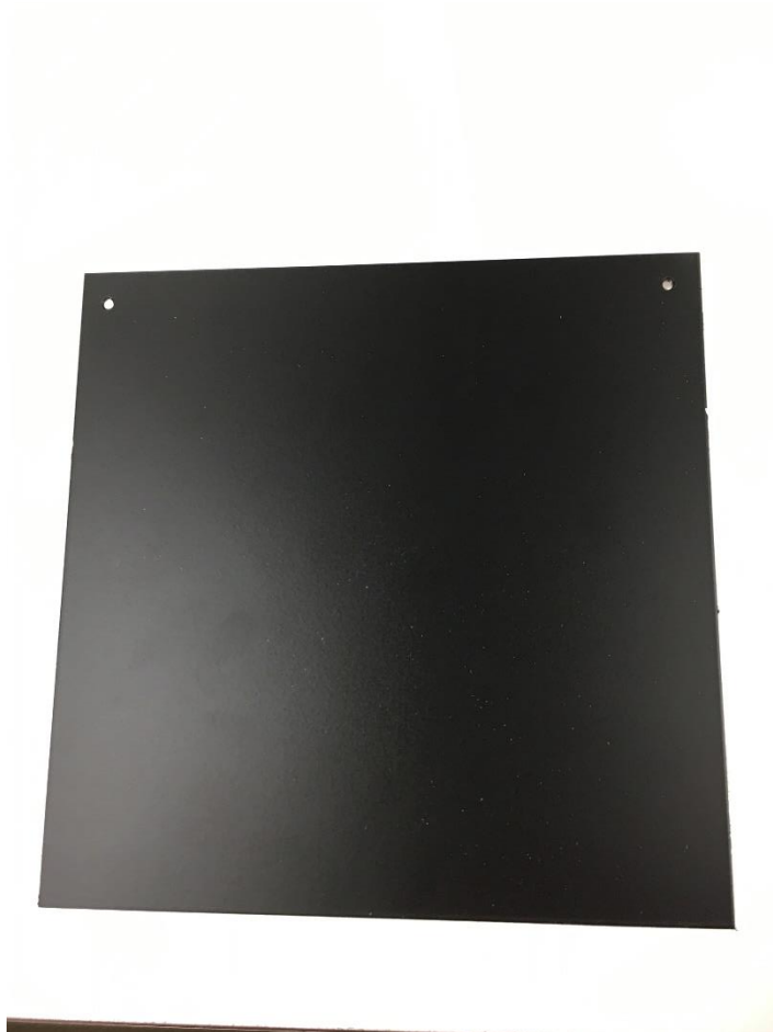
Photo of the test specimen